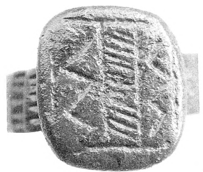
Fig. 1. Ring form grave 463 - detail

The ring is made of bronze, with the application of the techniques of casting and carving. Its analysis revealed that it is a later derivate, i.e., a rural variety of the luxurious aristocratic rings imported from Italy in the 15th century. Abandoning the complex Evangelical texts, the minute decoration on the head and the loop, the precious metals (gold and niello) and the painstaking techniques, the local craftsmen managed to imitate only the ornamental elements on these rings. Thus, for example, on the ring from Vodoča we see the letter R in the centre of the decorated surface on the head or, as it is known in some archaic Macedonian dialects, on the "little shield." Fig. 1.