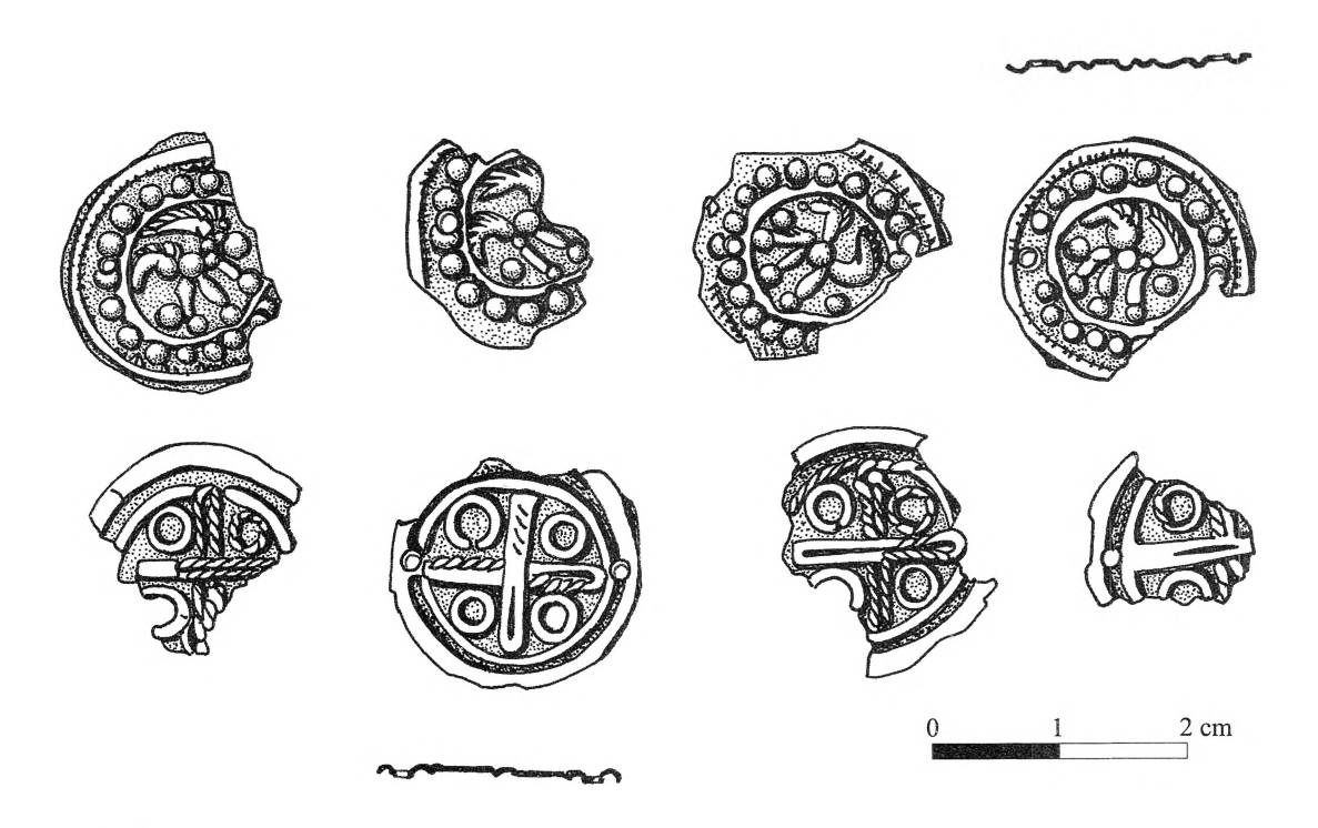
Fig. 4. Appearance of the applique from the hair-band (drawing D. Spasova)

cropolis;<sup>10</sup> therefore, the possibility that all these artefacts originate from the same local workshop should not be excluded; it was probably active during the late 15th and 16th centuries, while its craftsmen must have been inspired by numismatic patterns.<sup>11</sup>